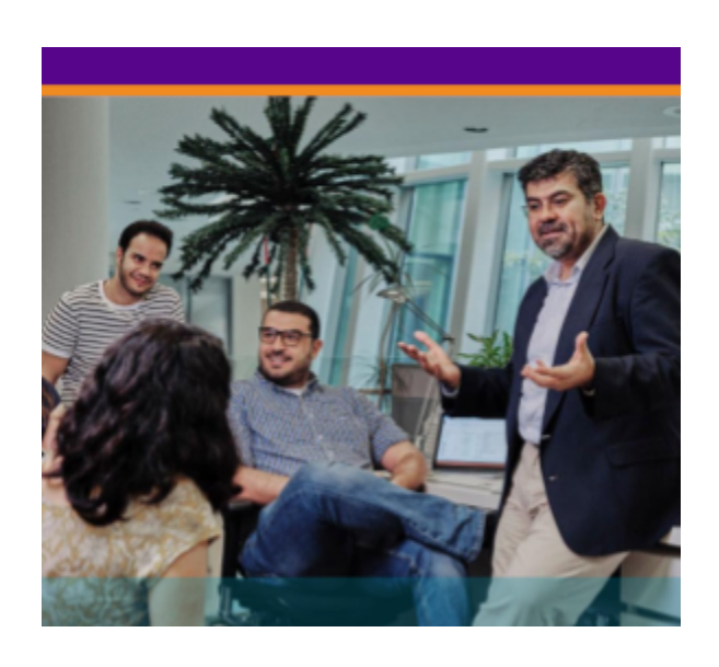
Mental health resources for faculty and staff are available here