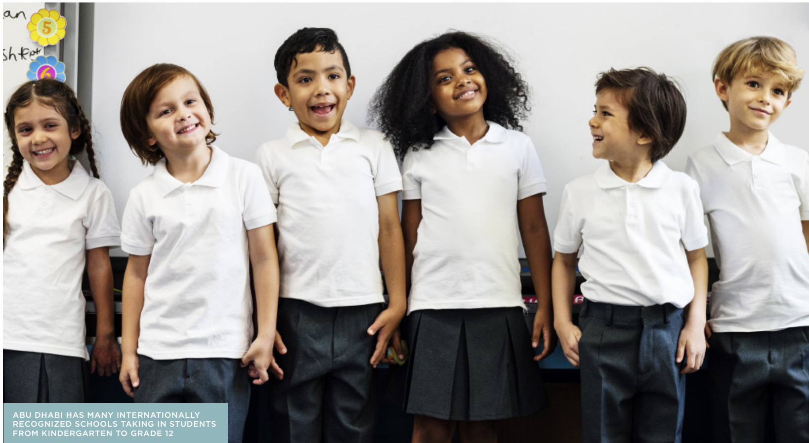
ABU DHABI HAS MANY INTERNATIONALLY RECOGNIZED SCHOOLS TAKING IN STUDENTS FROM KINDERGARTEN TO GRADE 12

The University also has a portable tuition remission program for dependent children of NYU Abu Dhabi employees studying undergraduate courses outside of NYU, subject to eligibility criteria and a maximum cap.