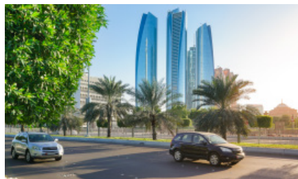
THE UNIVERSITY AND THE CITY ARE SERVED BY A NETWORK OF UNCONGESTED HIGHWAYS

Eligible employees can claim a transportation allowance to assist with local travel within the city.